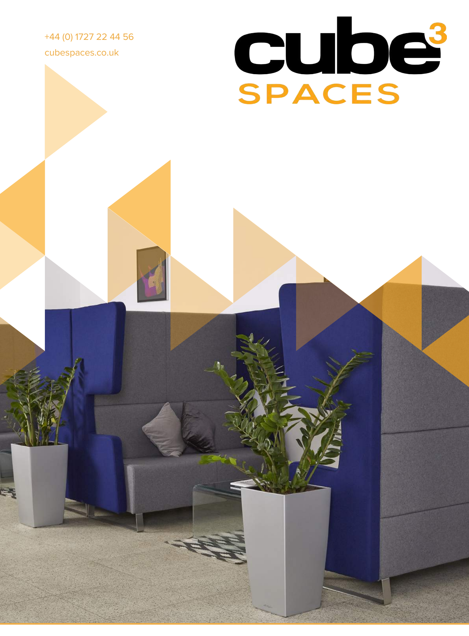
Hideout Range Guide